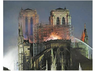
The blaze at Notre Dame Cathedral

"The prayers and thoughts of Catholics in East Anglia are with the people of France and those French citizens who live and worship in our diocese," he said.