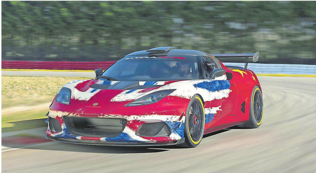
Lotus Cars has launched its brand new Evora GT4 Concept at the Shanghai Auto Show 2019