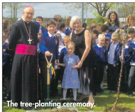
The tree-planting ceremony.