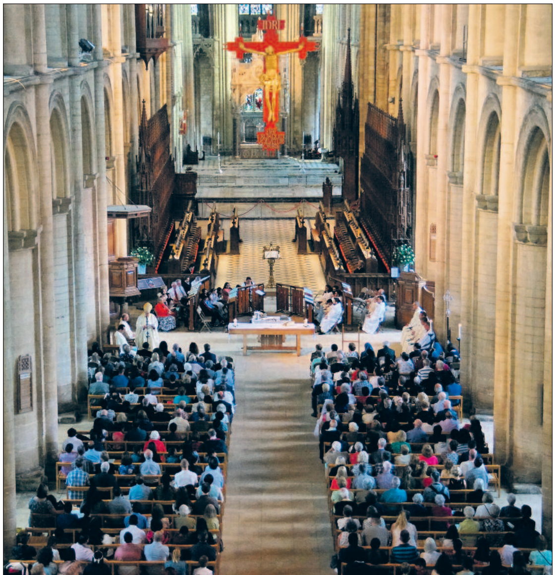
The One Mass in Peterborough Cathedral. To see a full picture gallery visit: www.rcdea.org.uk

"However there was no claim that this was the first Catholic Community Mass in the Cathedral since the Reformation, and there may possibly have been earlier occasions? In May 1987 there was an All Souls Deanery Mass. In April 2005 there was the Pope John Paul II Requiem Mass. Half-a-dozen One Masses have been held since then and the next one is planned for 2020."