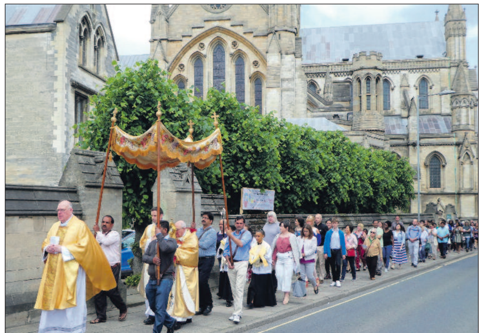
The Corpus Christi procession at the Cathedral in Norwich.