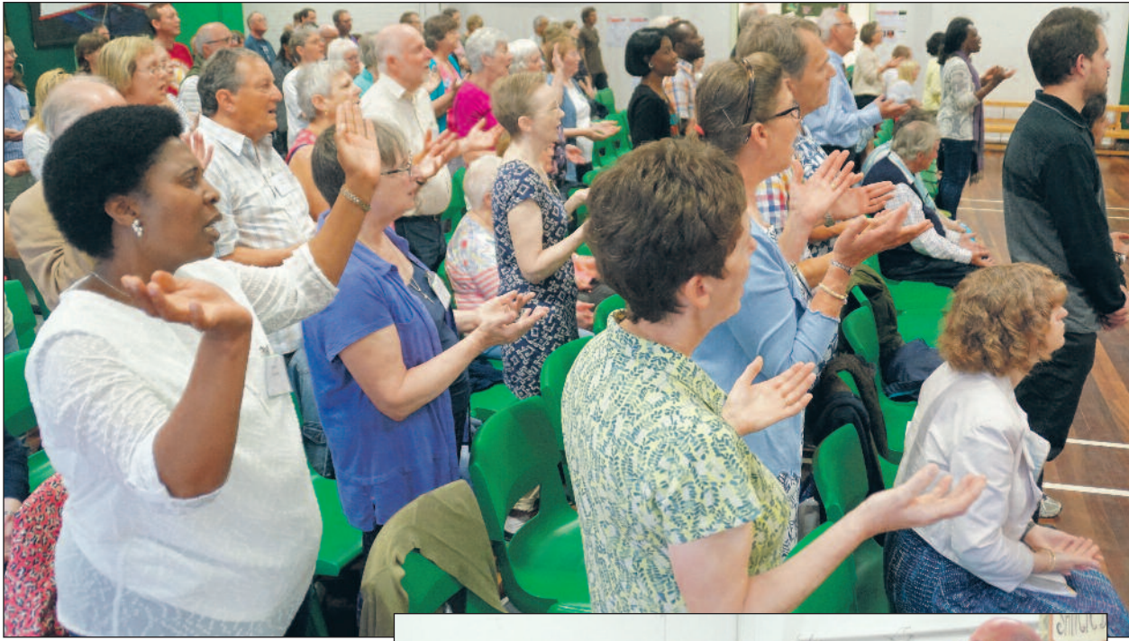
The Celebrate East Anglia weekend in Bury St Edmunds.