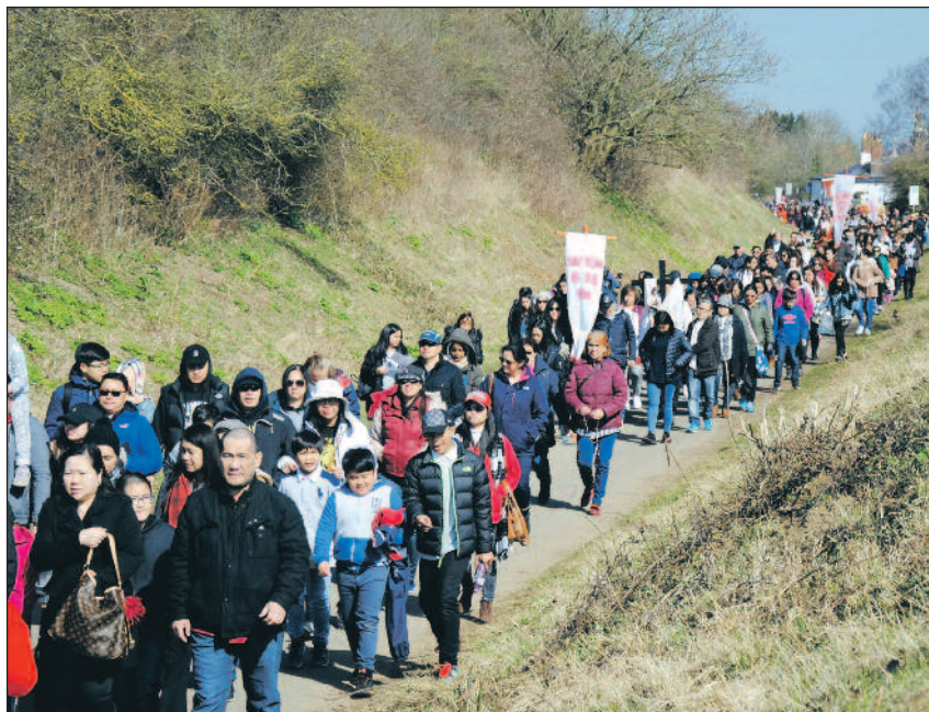
MARCH: Around 2,000 pilgrims joined the annual Filipino Palm Sunday Pilgrimage to Walsingham, including many from across East Anglia.