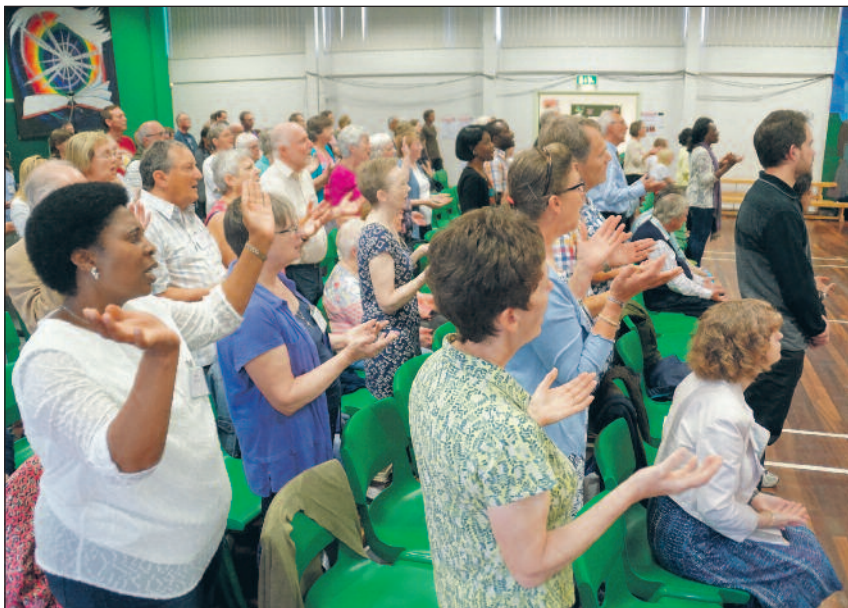
JUNE: People from across East Anglia gathered at Bury St Edmunds for the annual Catholic Charismatic family weekend, Celebrate East Anglia.