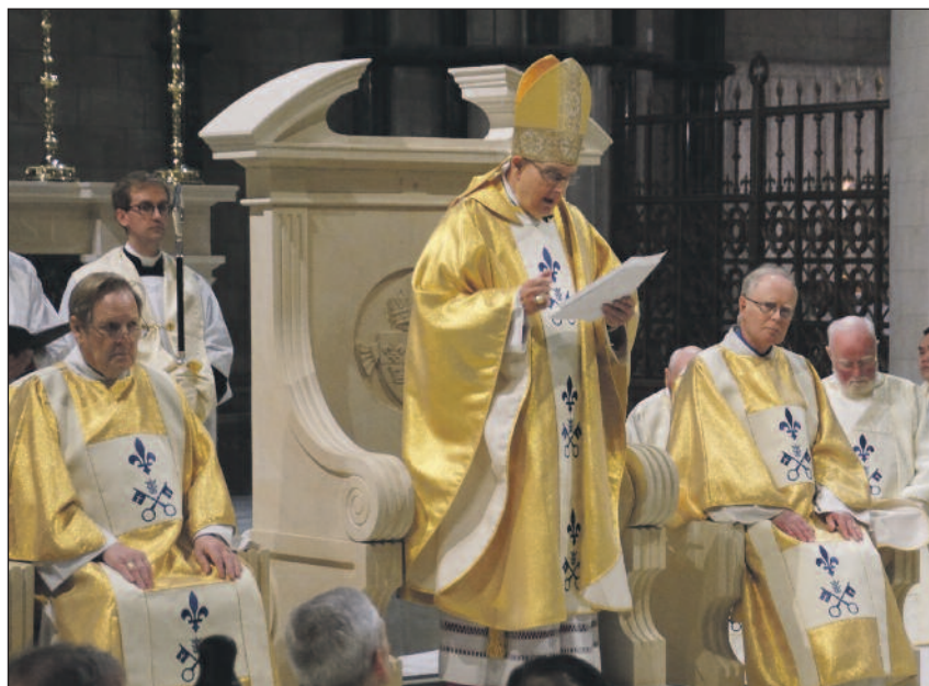
MARCH: A permanent new stone cathedra (bishop's chair) was blessed at St John's Cathedral in Norwich during the annual Chrism Mass.