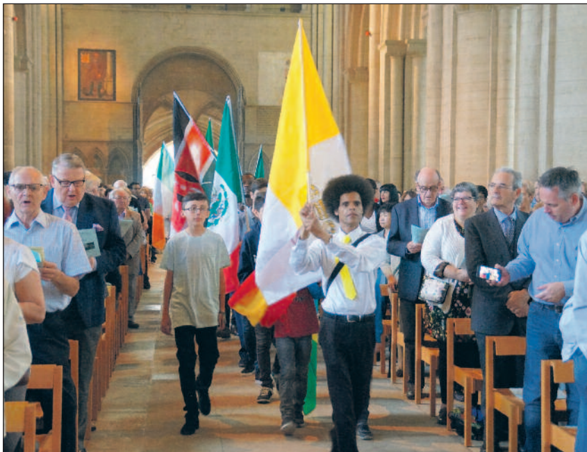
JUNE: Around 1,100 parishioners from St Peter and All Souls filled Peterborough Anglican cathedral for the deanery parishes Mass and international celebration.