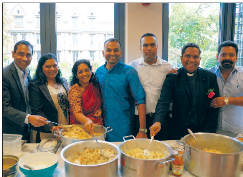
OCTOBER: A Curry for Kerala lunch at St John's Cathedral in Norwich saw over 250 people enjoy an Indian feast to raise cash to help flood-hit victims in Kerala.