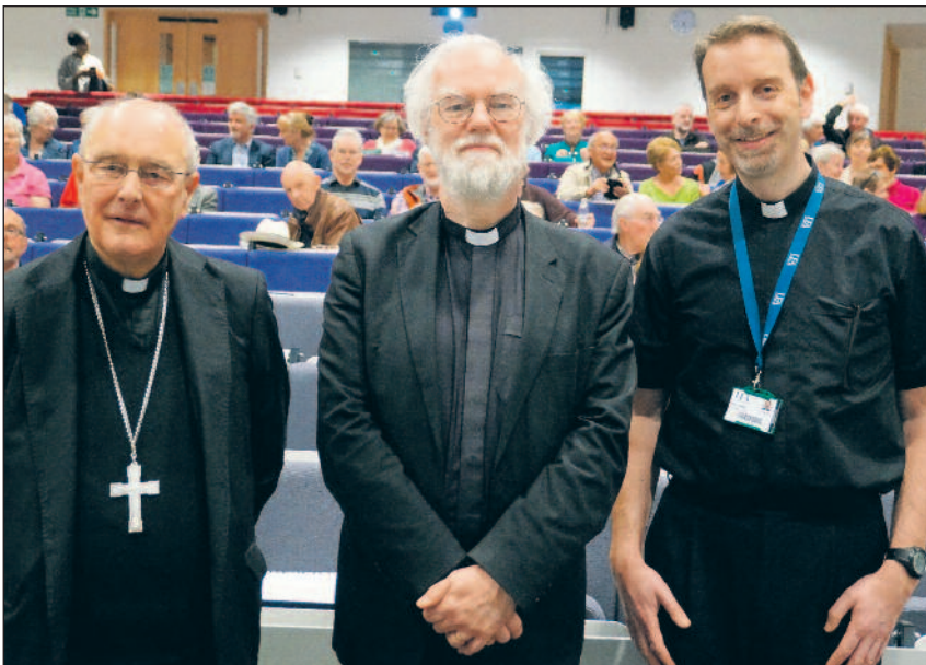
APRIL: Former Archbishop of Canterbury Dr Rowan Williams spoke at the Newman Lecture Series at the University of East Anglia in Norwich