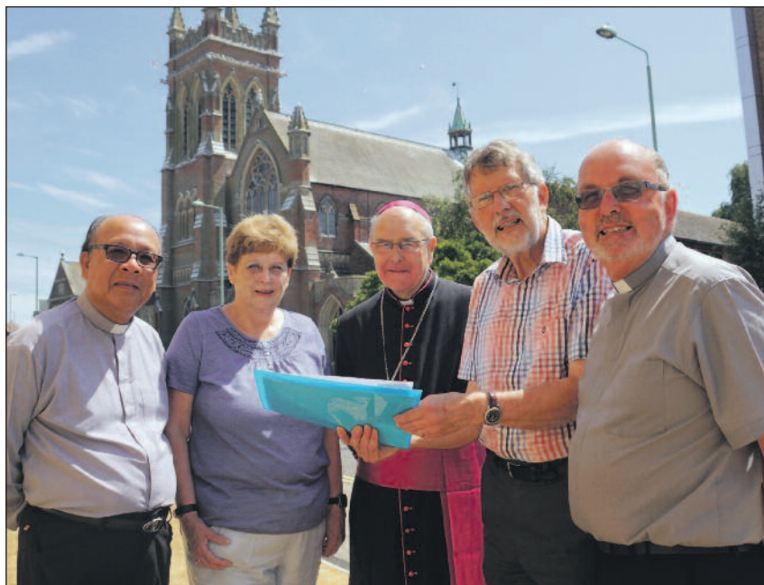
JULY: Our Lady Star of the Sea in Lowestoft received a Heritage Lottery grant to enable a £285,000 restoration and visitor access project to go-ahead.