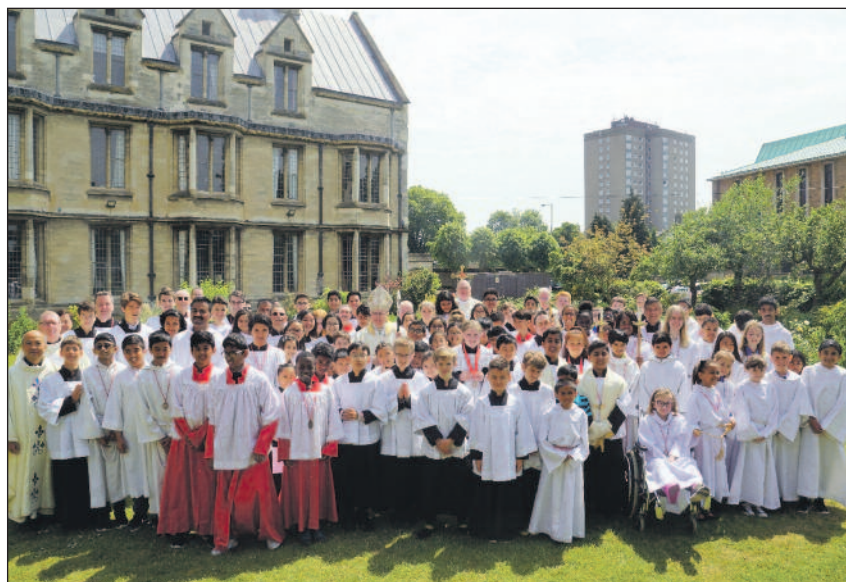
MAY: Over 100 altar servers from across East Anglia gathered with their families for a special Mass and barbecue at St John's Cathedral in Norwich.