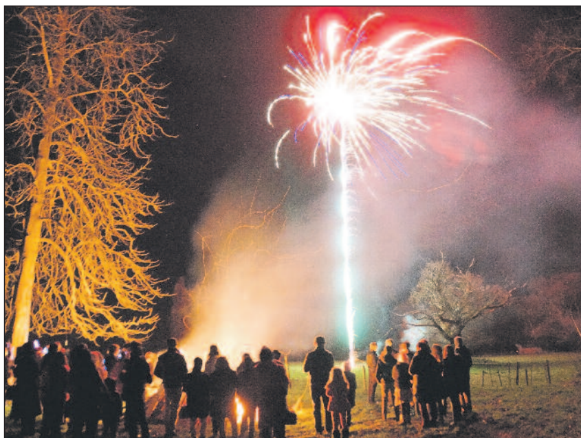
JANUARY 2018: A light-filled celebration of Epiphany took place at the White House, Poringland, enjoyed by young people and families from across East Anglia.