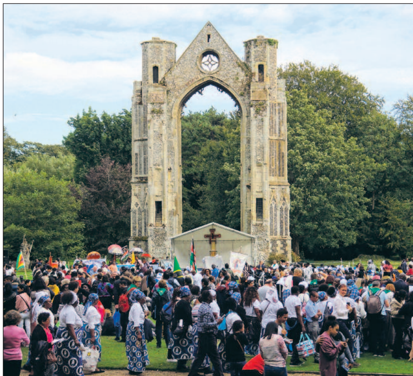
SEPTEMBER: The Dowry of Mary Pilgrimage at the site of Walsingham Abbey.