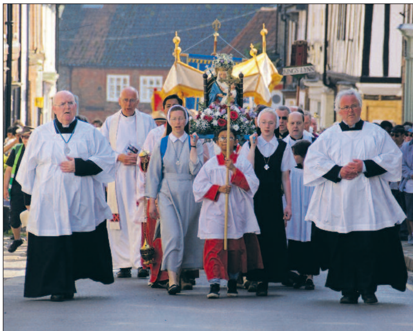
MAY: Around 900 people joined the annual Diocese of East Anglia pilgrimage to Walsingham in record-breaking temperatures.