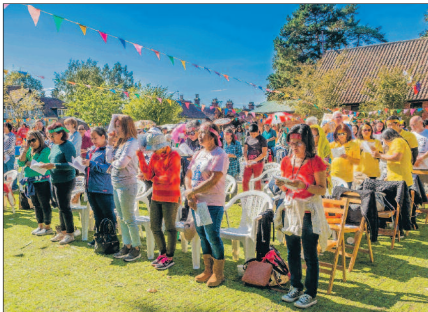
SEPTEMBER: Around 700 devotees attended the eighth annual celebration of Our lady of Peñafrancia's religious festivities which culminated with a High Mass in the church grounds of St Helen's Catholic Church at Hoveton on the Norfolk Broads.