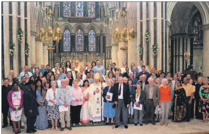
JUNE: Over 60 couples and their families celebrating special anniversaries took part in the annual Marriage and Family Life Mass at St John's Cathedral in Norwich.