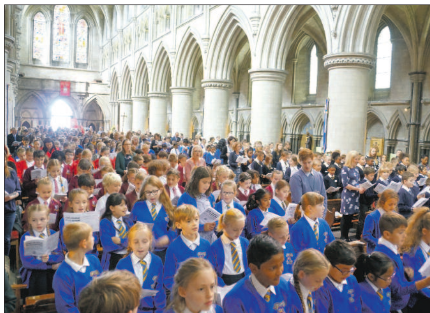
SEPTEMBER: 700 pupils and teachers from schools across the Diocese of East Anglia gathered at St John's Cathedral to mark the start of the school year.