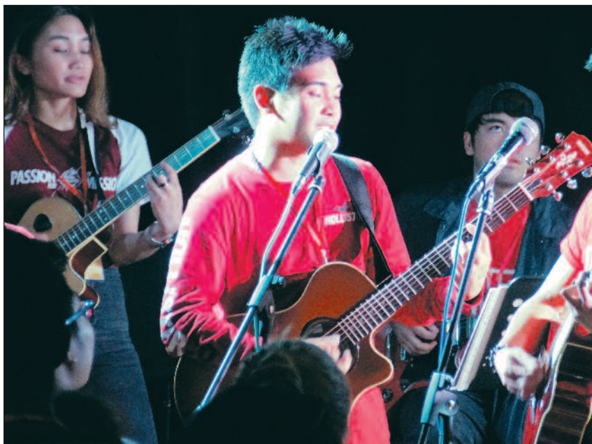
MAY: Over 200 young people from across East Anglia enjoyed worship, activities and speakers at the Ignite Youth Festival at Sacred Heart School in Swaffham