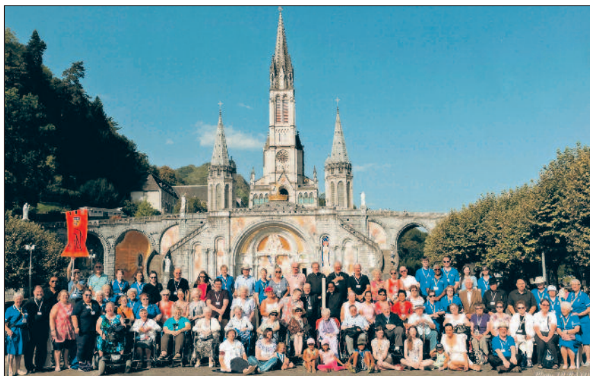
AUGUST: The Diocese of East Anglia pilgrimage group at Lourdes.