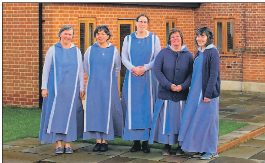
DECEMBER 2017: The Community of Our Lady of Walsingham, the country's newest religious community, received the keys to its first convent near Dereham.