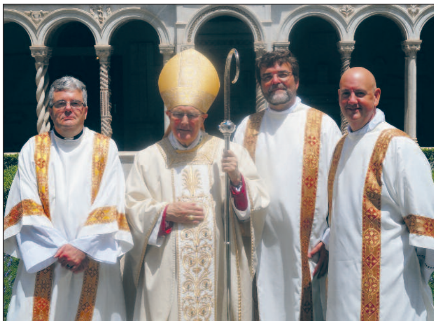
JUNE: Three East Anglian seminarians were ordained as deacons by Bishop Alan during a celebration of Mass at St Paul's-outside-the-Walls Basilica in Rome.