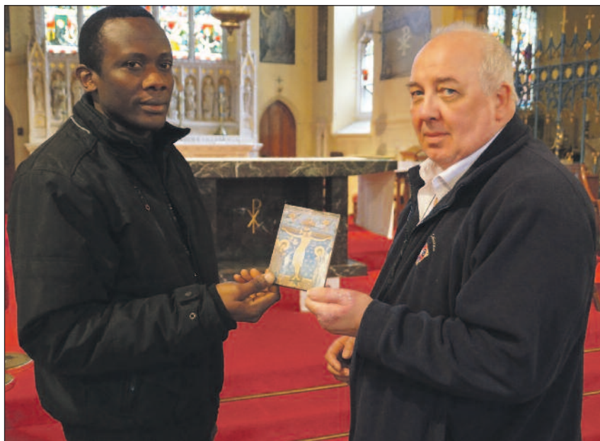
MARCH: St Mary's Church in Great Yarmouth remained open despite an arson attack and hate crime incident by an intruder.