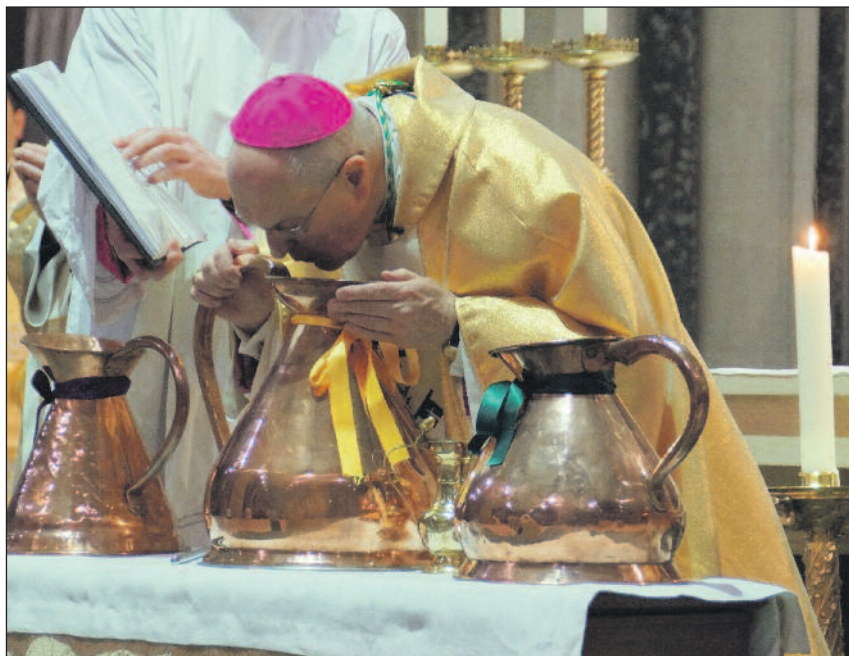
MARCH: Over 1,000 people attended the annual Chrism Mass at St John's Cathedral during which priestly promises were renewed and sacred oils blessed.