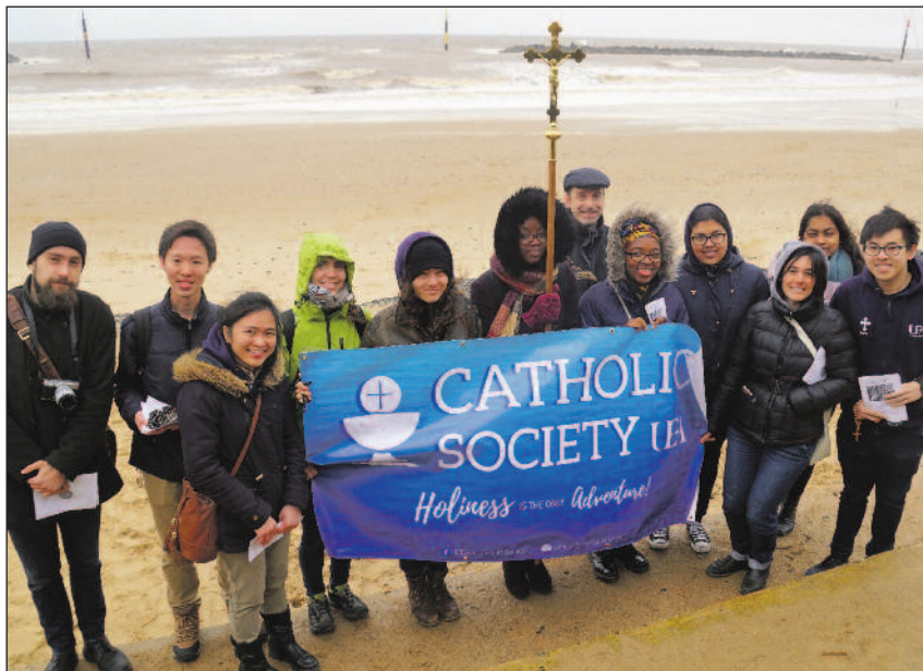
APRIL: The first-ever national Rosary on the Coast prayer initiative was marked by hundreds of people who braved the rain and wind at a dozen East Anglian locations.