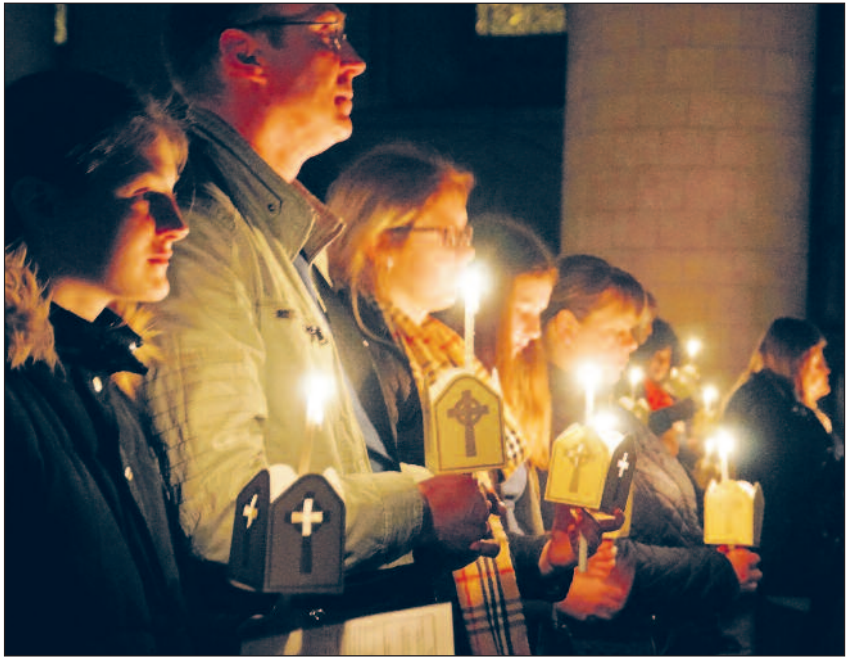
MARCH: Hundreds of people attended the Easter Vigil at St John's Cathedral in Norwich on Easter Saturday.