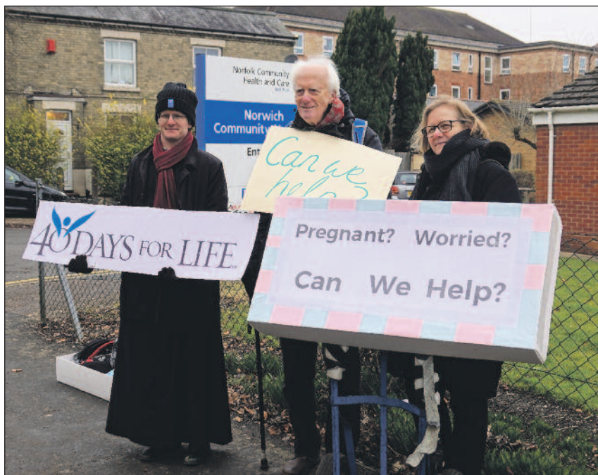
FEBRUARY: A 40 Days for Life vigil took place outside an abortion clinic in Norwich as part of an international campaign.