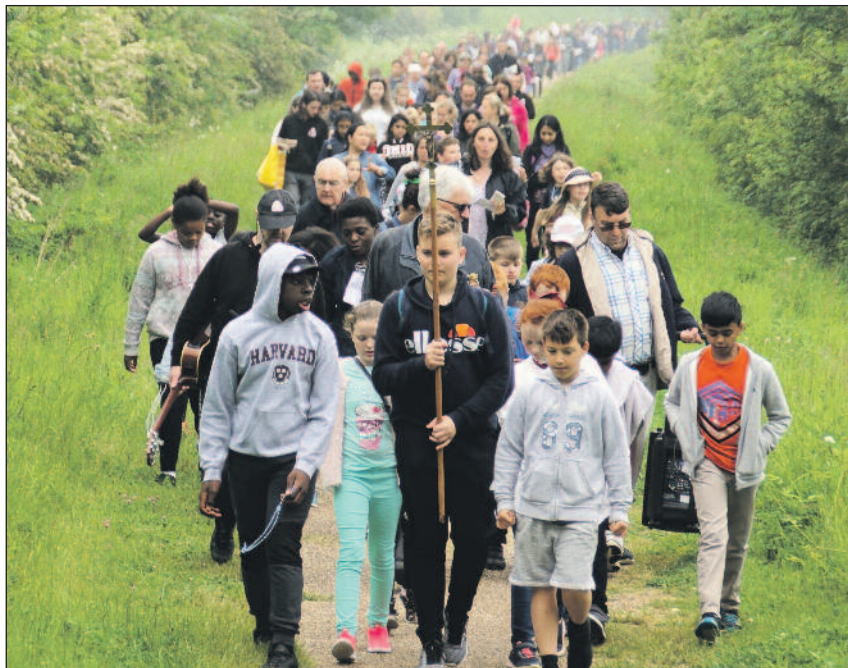
JUNE: An enthusiastic annual Children's Pilgrimage and Mass at Walsingham was joined by over 400 young people and adults.